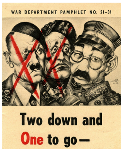
Figure 3: A 30-minute documentary directed by Frank Capra