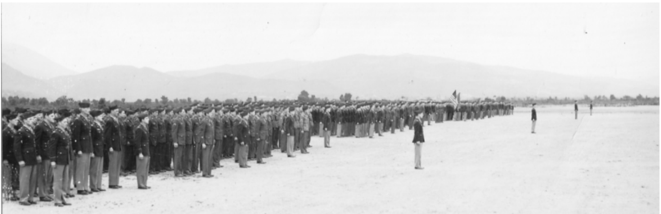
Figure 2: Awards Ceremony

A lecture and discussion meeting was held in the evening at which the War situation was reviewed, and movies were also shown of action on the Western Front.