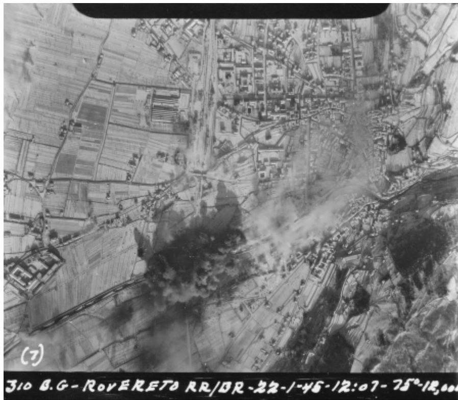
Figure 1: January 22, 1945 attack on the Rovereto Railroad Bridge