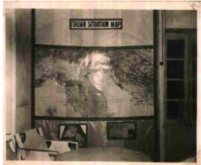
Figure 3: War Room

25 Christmas Day. No mission. The men just took it easy, recuperating from last night's indulgences! Turkey for dinner.