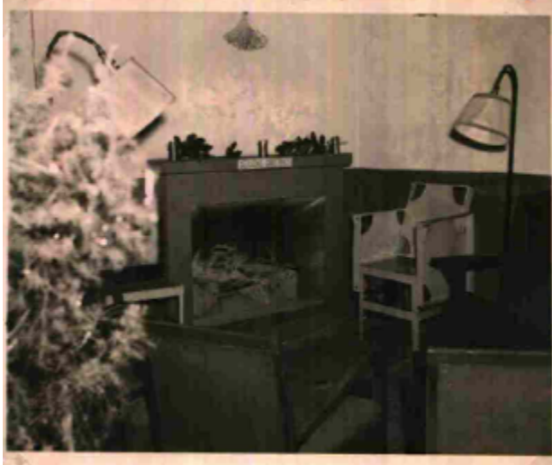
Figure 2: Officers Club, decorated for Christmas