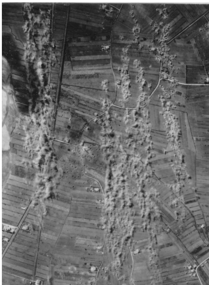
Figure 2: Troop Concentrations, Rimini September 18, 1944