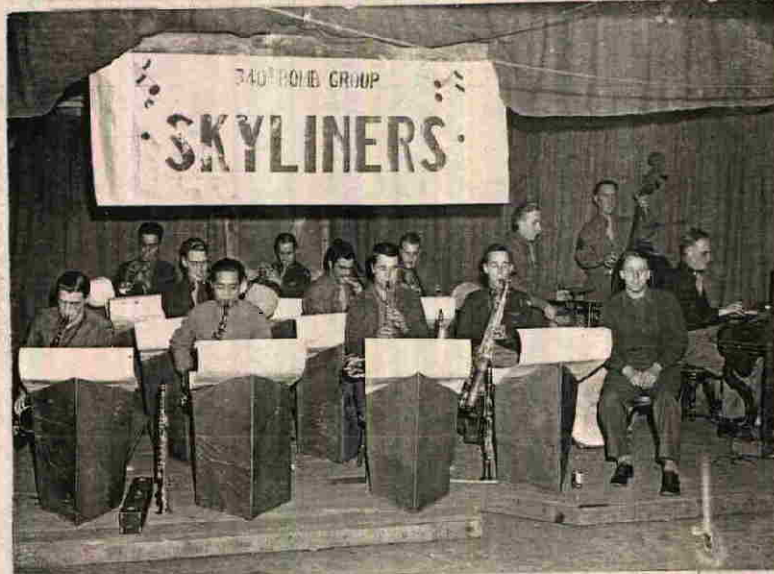
The SKYLINERS play for the Enlisted Men's party given at the Red Cross Club.