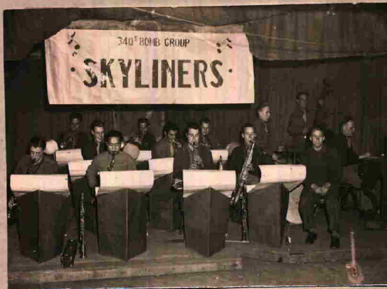
The SKYLINERS play for the Enlisted Men's party given at the Red Cross Club.